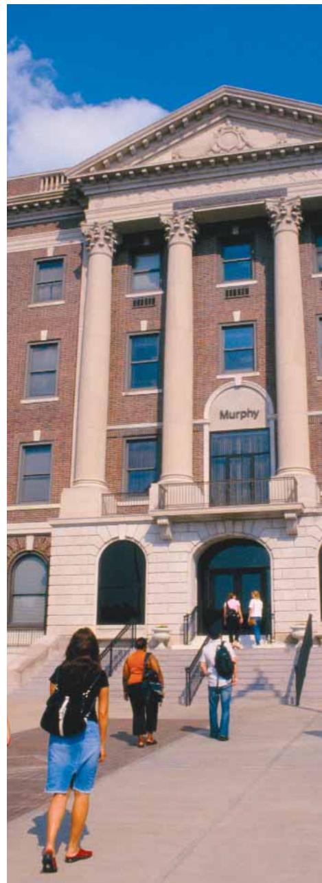
Students enter the University of Kansas Medical Center, the new home for BioTarget's research and development facility.