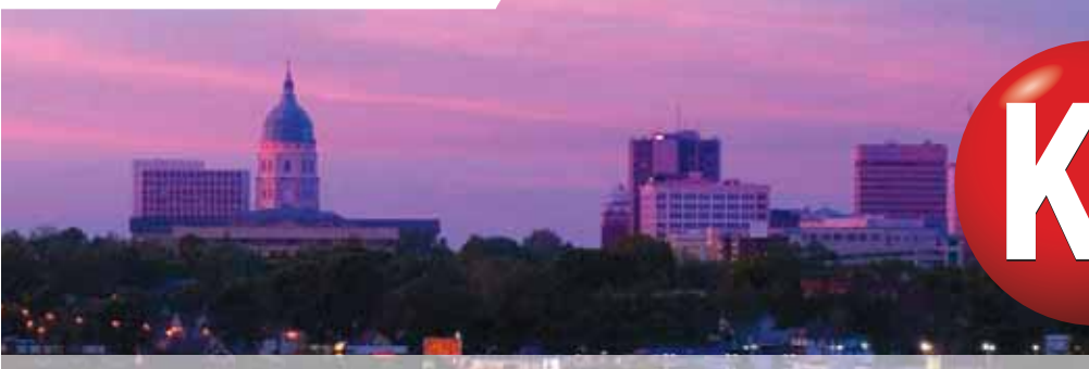
Sunset over Topeka, Kan. and Kansas State Capitol Building on the west edge of the KC metropolitan area.