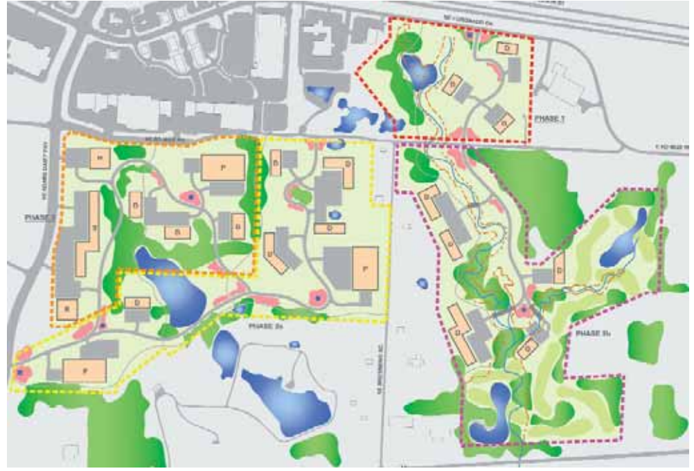
The Missouri Innovation Park in Blue Springs, Mo. will eventually cover more than 500 acres and offer unique university research partnerships.

For more information, please visit bluespringsedc.com .